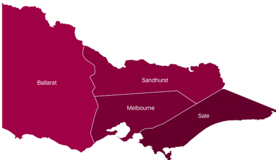
Map of Victoria's Catholic dioceses