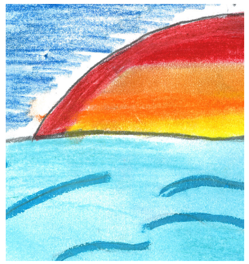
Caring for the love of God

Today, a globalised environment means that young people must be versatile learners who develop and apply a range of capabilities associated with working, communicating and collaborating with others across the world. These capabilities include not only new knowledge and skills, but also new literacies, dispositions and cultural awareness. Learning within a globalised environment offers new opportunities not only to understand others, but to understand more deeply one's self, identity, and cultural practices.