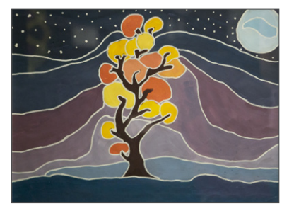
Loneliness Scout, Year 5 St Mary's Primary School, Hampton