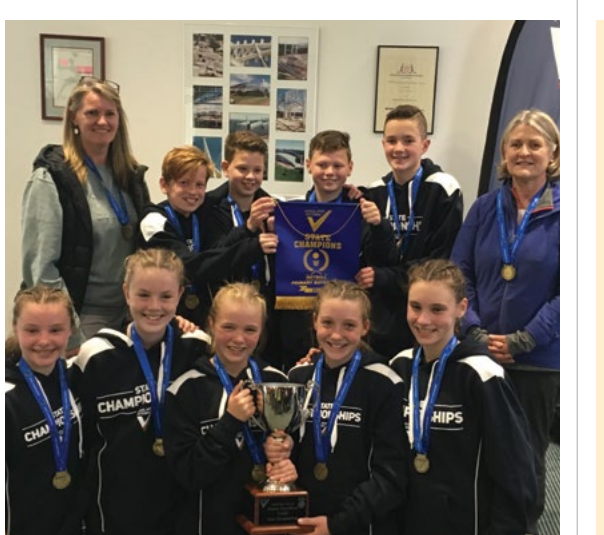
The St Thomas the Apostle School, Blackburn, mixed netball team was crowned School Sport Victoria State Champion in 2019.

Sport and physical education help students develop a sense of connectedness and belonging.