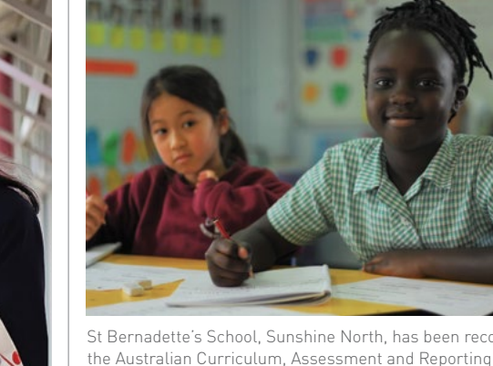
St Bernadette's School, Sunshine North, has been recognised by the Australian Curriculum, Assessment and Reporting Authority (ACARA) for consistently delivering strong progress in NAPLAN writing assessments by adopting innovative pedagogical practices, informed by evidence, at both whole-school and classroom levels.