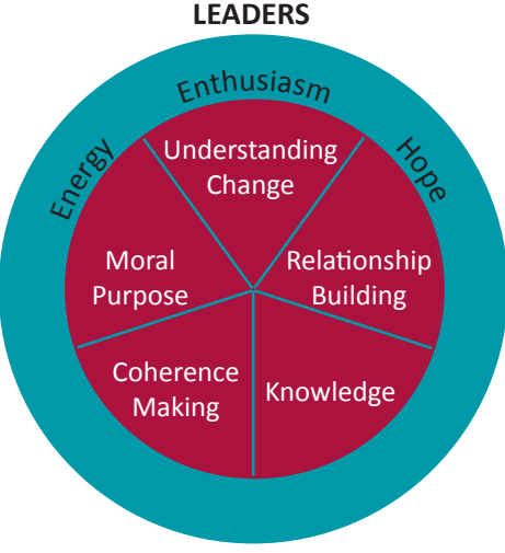
Figure 2 - Framework for Leadership

The family school partnership leader combines these personal qualities and tasks aligned with theory and a partnership approach to learning and teaching.